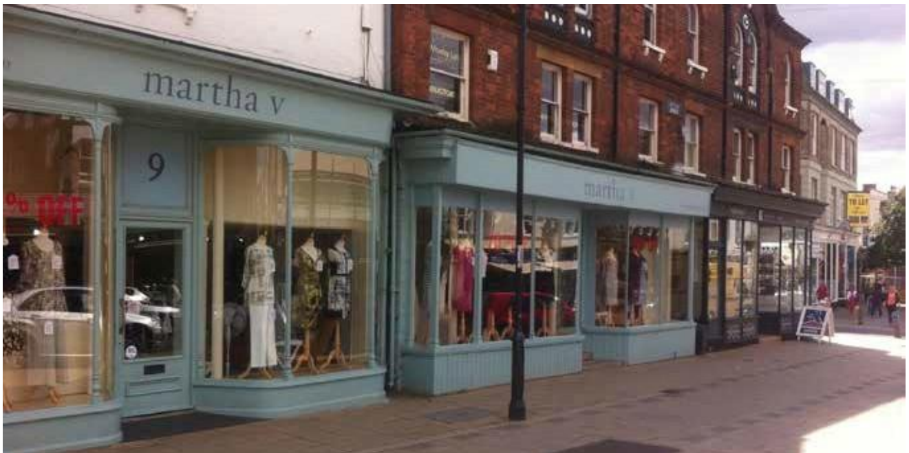
Shopfronts in sympathy with the buildings above using a common colour scheme

Well-designed shop fronts improve the shopping experience and enhance their surroundings. A sympathetically-designed shop front will enhance a building and restore its architectural unity.