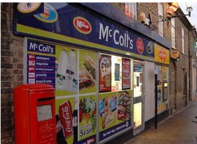
Window stickers can dominate and deaden a shop frontage