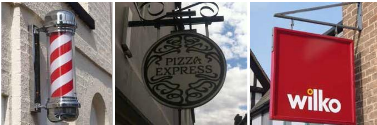
Good examples of modern and traditional hanging signs

8.10 Projecting signs at fascia level should be a maximum of 0.2 sq metres, for example 500mm x 400mm. Hanging signs above fascia level where appropriate, should not exceed 800mm high x 600mm wide. The sign should be a minimum 2.4m above the footway and the outer edge should be a minimum distance of 60cm from the kerb. A well-designed, traditional symbol representing the business can be an eye-catching alternative. On more modern buildings, simple projecting signs may be acceptable.