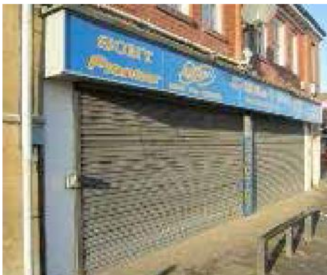
Visually harsh and unsympathetic external roller security shutters with bulky grille boxes

10.2 Solid external shutters are visually intrusive, ‘deaden’ the street frontage and create an unwelcoming environment. They are vulnerable to graffiti and fly-posting. External shutters are only acceptable in special circumstances with the support of Suffolk Constabulary where there is a persistent problem of crime or vandalism which cannot be addressed by any other measures. (Delete images below and replace)