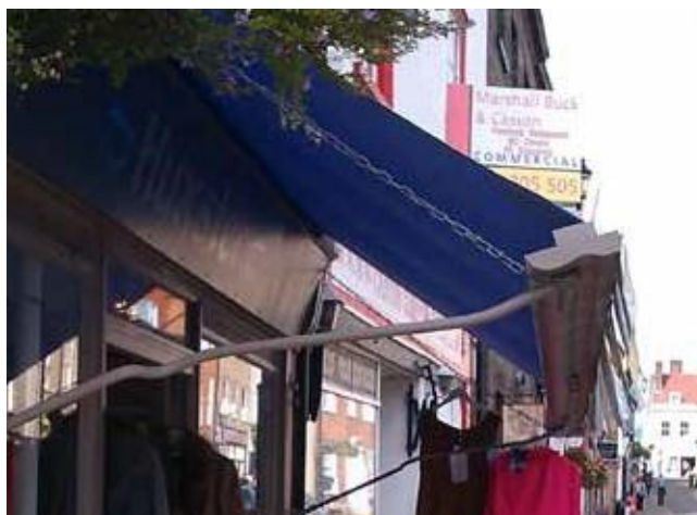
Retractable cloth awning / roller blinds