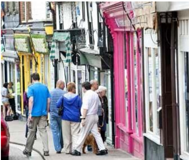
Effective use of colour adding vibrancy to the street scene