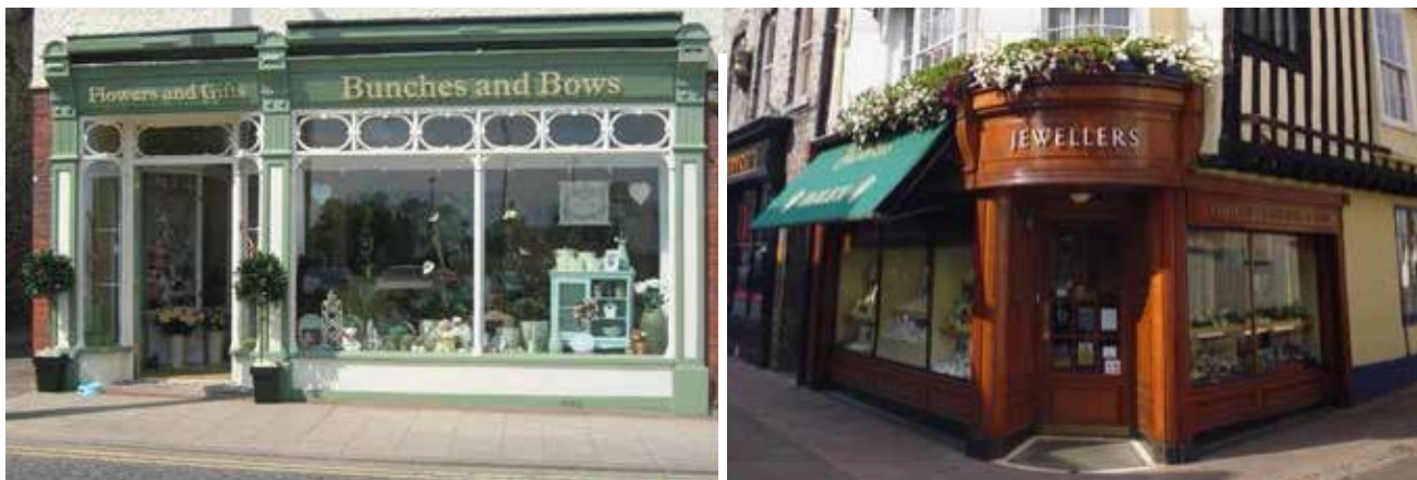
Examples of traditionally designed shopfronts retaining original detail

typically include timber vertical mullions and a transom rail at door head height with transom lights above. The entrance door is normally set back from the edge of the pavement.