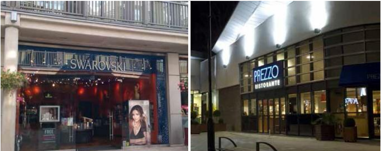
Examples of modern shopfronts

(Insert new para 6.9 'New Shops' – See page 15 and renumber subsequent paras accordingly)