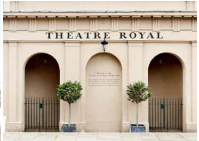
Good examples of applied and hand painted lettering