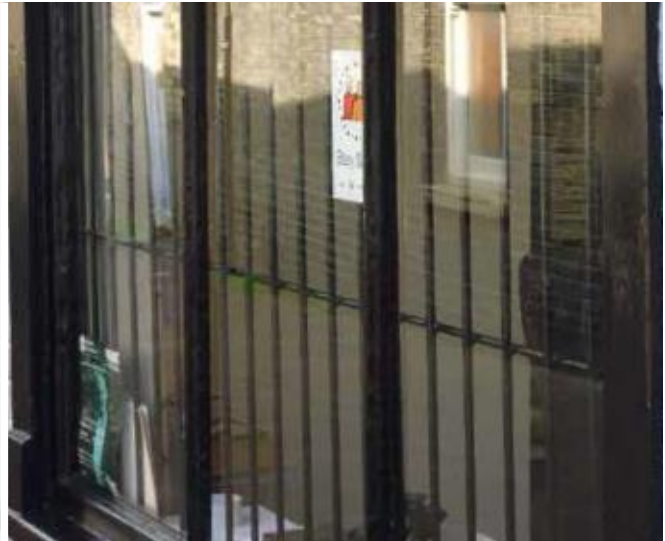
Permanently fixed internal bars

Internal lattice or brick bond roller type grilles are preferable to external shutters as they can be set between the display and the glass with the coil fitted in an existing false ceiling or the window soffit and not seen from outside.