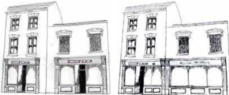
Shopfronts designed in sympathy with the building

Poor quality shop fronts can erode local character and provide an unattractive place for visitors to shop. Long unbroken shop fronts do not respect the character of the building and have little visual appeal.