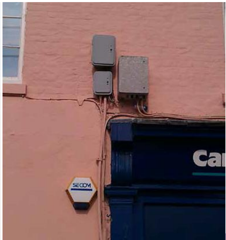
Alarm boxes should be as discreet as possible