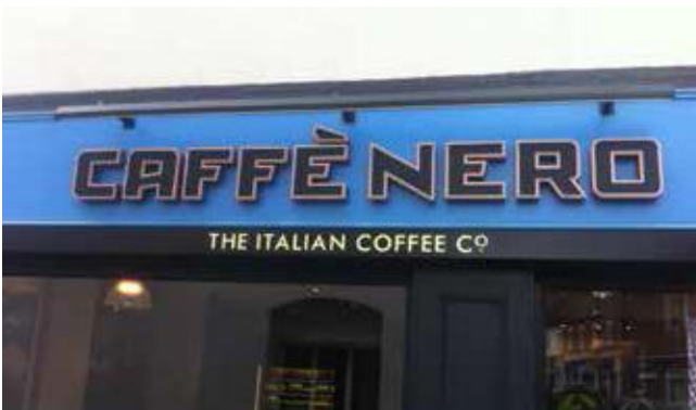
Contemporary style fascia