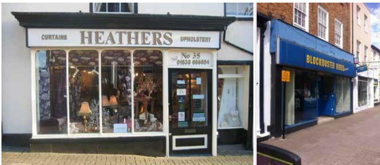
Traditional designed shop front retaining original detail