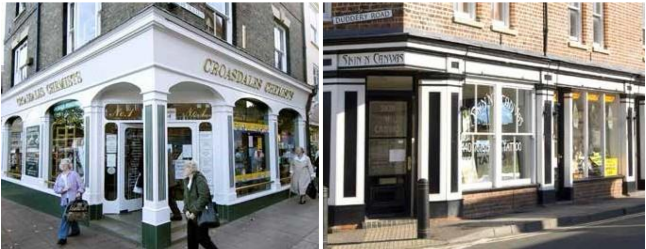
Examples of shopfronts incorporating the basic elements of good shopfront design and quality materials