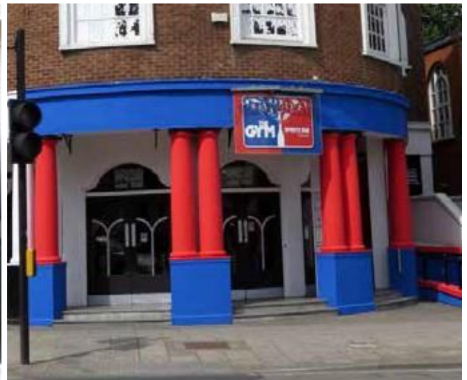
Inappropriate use of visually dominant colours