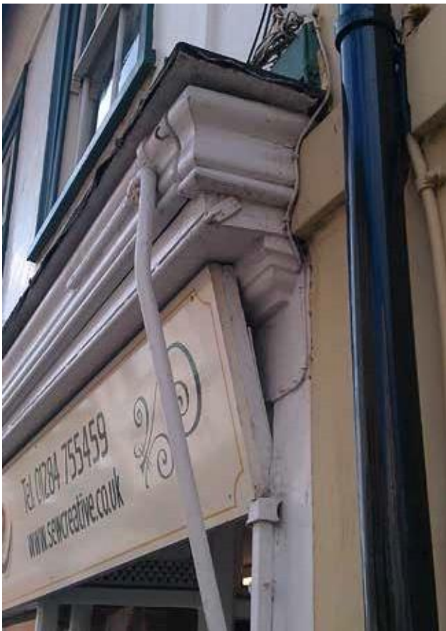
Detail of a closed traditional blind incorporated into the cornice above the fascia

(Check on site re console brackets. Either source another blind photo or add EH suggested wording re fascia if appropriate)