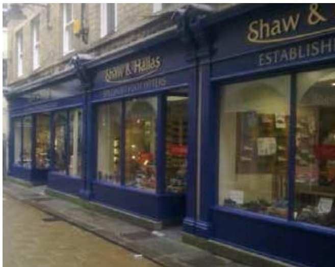
Contemporary stall riser