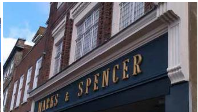
Traditional style fascia