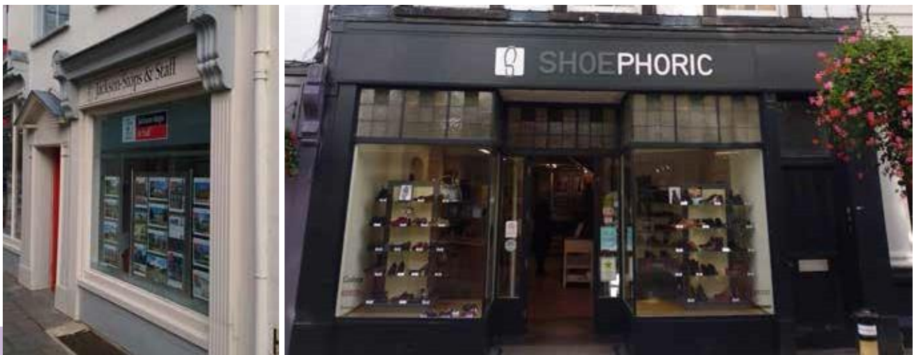
Examples of shop fronts incorporating the basic elements of good shop front design and quality materials (Add images of well designed modern shop fronts)