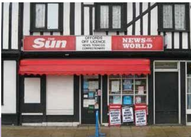
Unsympathetic non-retractable Dutch canopy