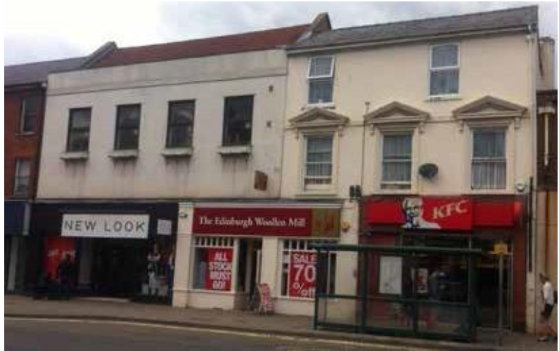
Shopfront unsympathetic to building