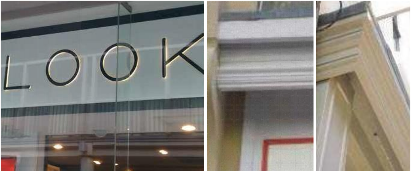
Example of halo style lighting (Credit Images or replace)

8.13 Where lighting is appropriate, external lighting of the fascia is normally preferable. This should be by means of concealed lighting such as slimline LED trough lighting (preferably recessed into a projecting cornice). Carefully positioned small spotlights may be an alternative. Large spotlights, swan neck lamps or heavy canopy lights should be avoided, as they can clutter a building and be over-bright. Suffolk County Council should be consulted regarding luminance standards for lighting fronting the highway. In all situations, only the lettering to a sign, and not the whole fascia, should be illuminated. Outside conservation areas and not on listed buildings, individual halo lit letters can be a subtle form of lighting, providing the letters have a small projection off the fascia.