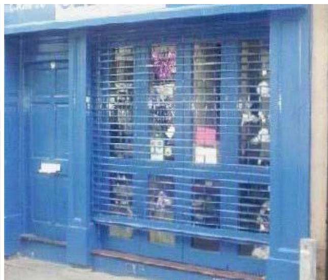
External brick bond lattice roller shutter with housing concealed in the fascia