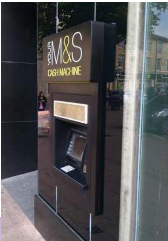
Sensitively sited and restrained ATM