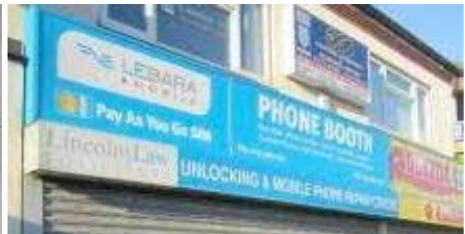
Inappropriate oversized fascias and deep projecting box fascias (Replace above with higher quality images)