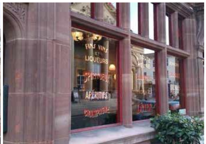
Gilded paint window lettering in an appropriate size and style for the building