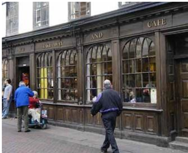
Traditional timber stall riser