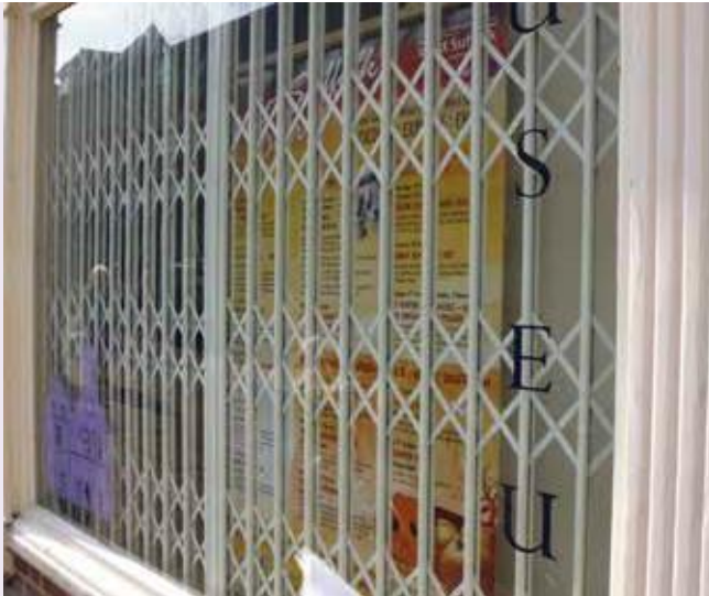
Internal sliding grille