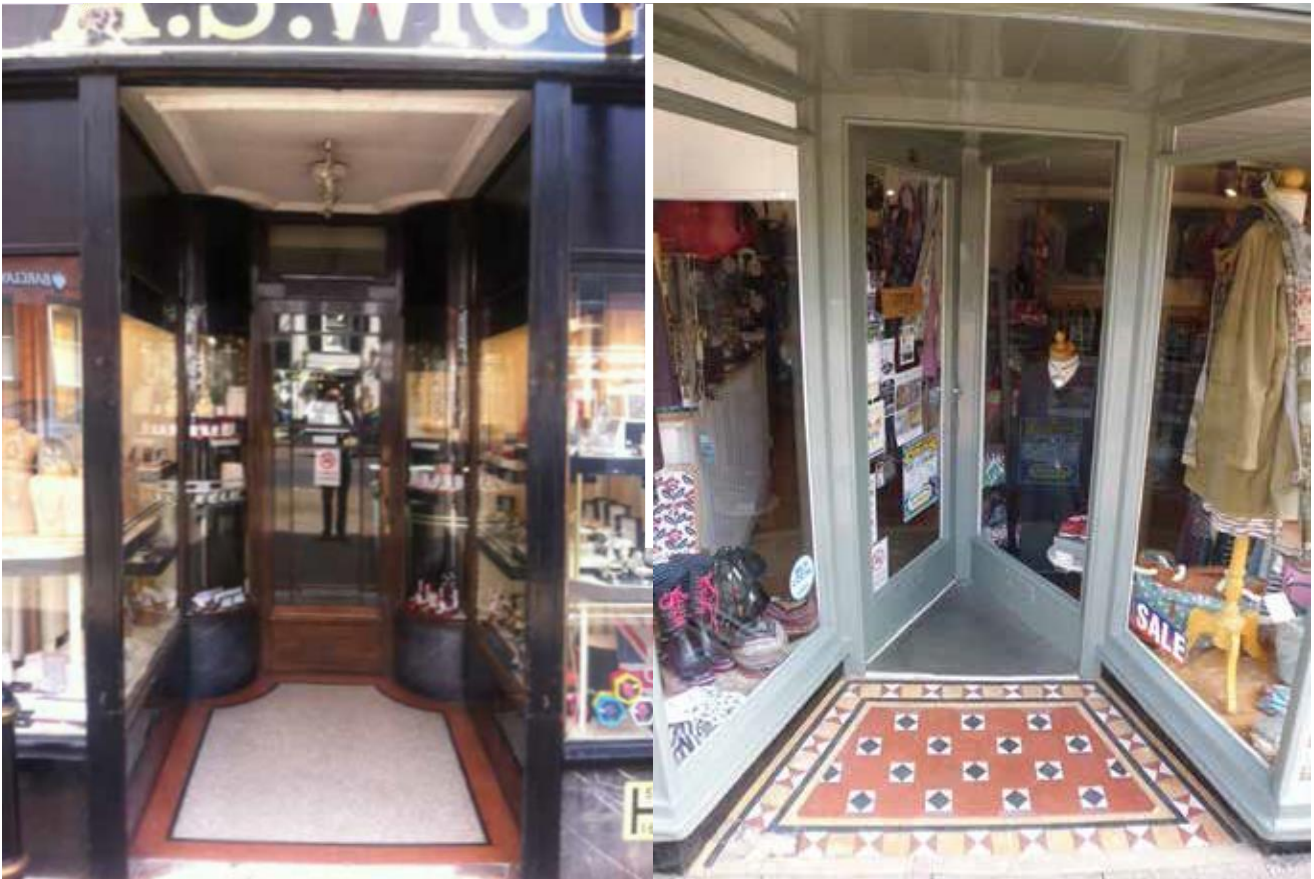
Well designed entrance: recessed, level access and outward opening